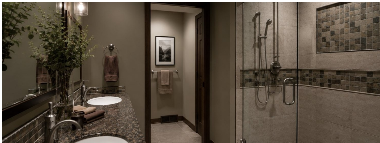
Warm porcelain tile pairs beautifully with stone and rich finishes.

A quick rule of thumb for Florida: if a room ever gets wet — bathrooms, laundry, entry, kitchen — go fully waterproof (vinyl or porcelain). For bedrooms and formal living areas where you want the richness of real wood, engineered hardwood shines.