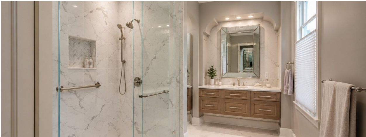
Porcelain look-marble flooring — fully waterproof and built for Florida's humidity.

The floors that thrive here share three traits: they're waterproof (not just water-resistant), they stay dimensionally stable when humidity swings, and they don't feed mold or mildew. That's why luxury vinyl plank and porcelain tile are the workhorses of Central Florida homes.